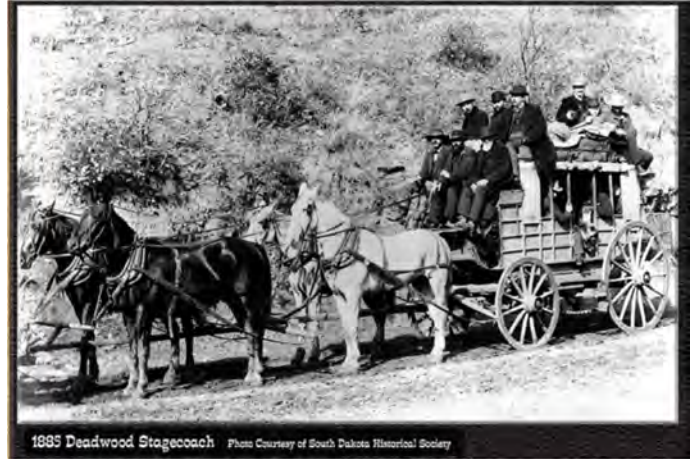
1885 Deadwood Stagecoach