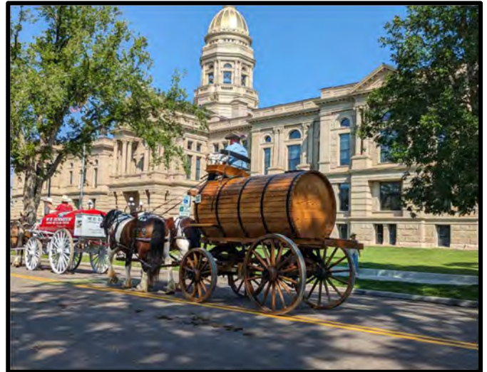
Left: Hitch Wagon