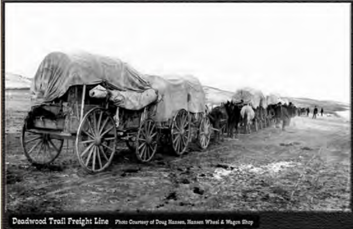
Deadwood Trail Freight Line