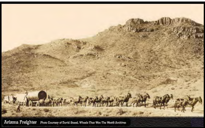
Arizona Freighter