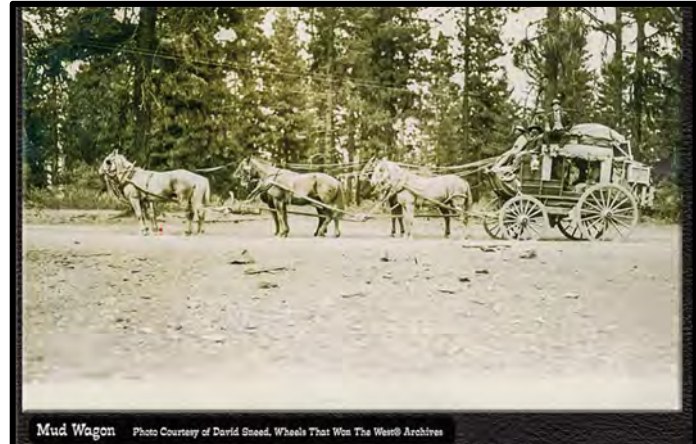
Mud Wagon