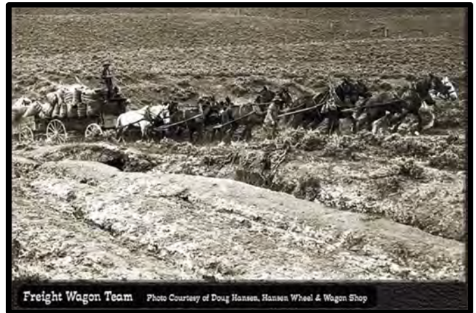
Freight Wagon Team