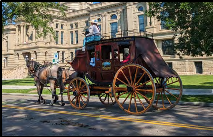
Left: Concord Stagecoach