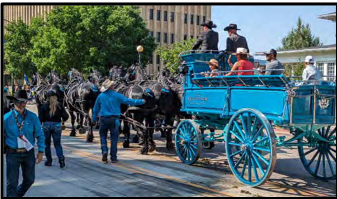
Below: Yellowstone National Park Touring Coach