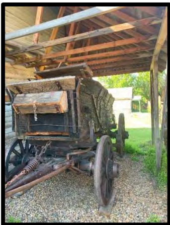
Gold ore wagon that was used in the Virginia City, Montana