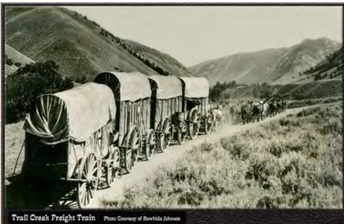
Trail Creek Freight Train